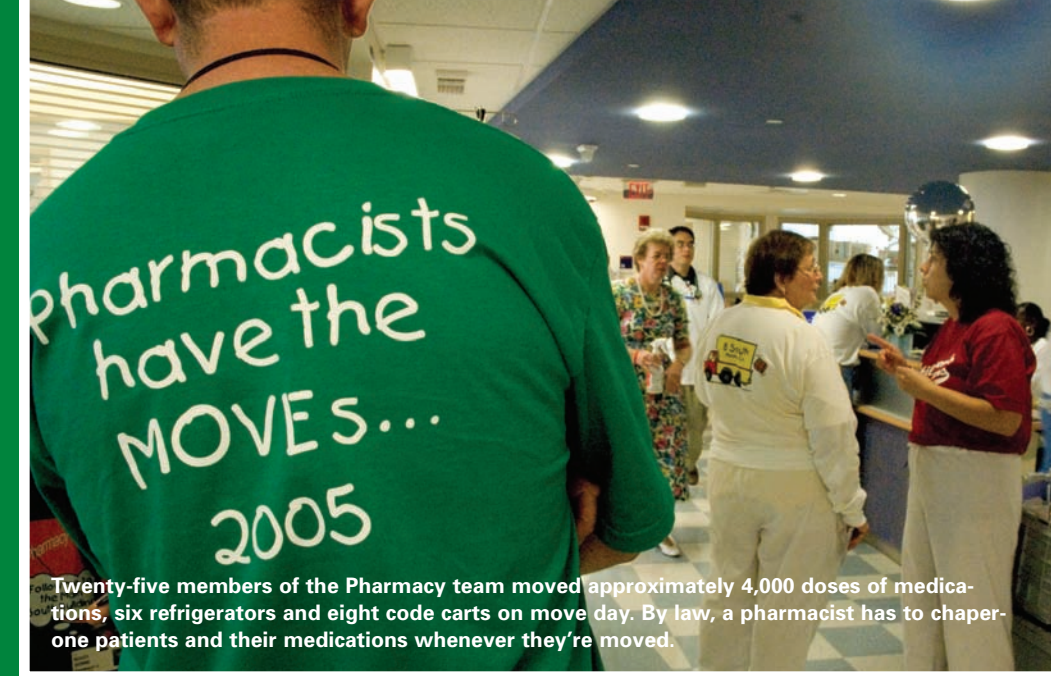
Twenty-five members of the Pharmacy team moved approximately 4,000 doses of medications, six refrigerators and eight code carts on move day. By law, a pharmacist has to chaperone patients and their medications whenever they're moved.